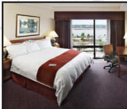
Radisson Quad City Plaza www.radisson.com/davenport 111 E. 2 nd St., Davenport, IA 52801

PLEASE MAKE YOUR HOTEL RESERVATIONS BY AUGUST 24, 2013 AND REQUEST THE WATERFRONT CONFERENCE RATE . Conference rates are available for rooms reserved by conference attendees for any number of nights from September 24-30, 2013. Rooms and rates will be subject to availability after August 24.